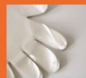
Blown & Cast films