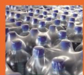
Blown & Cast films