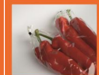
Blown & Cast films