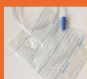
Blown & Cast films